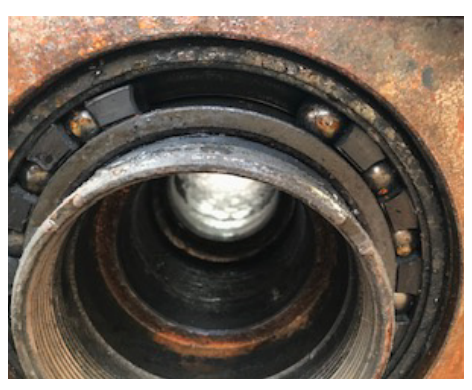
Worn competitor bearing

Each PERMALUBE carriage comes with a 3 year/35,000 cycle warranty. It is permanently lubricated on the gear side and lance hub bearings. There is no need for relubrication and no oil levels to check or top off making it100% leak proof. All of these factors make the PERMALUBE carriage maintenance free which saves you time and money.