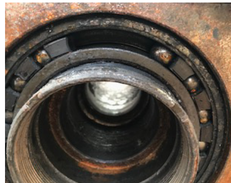
Worn competitor bearing

Each PERMALUBE carriage comes with a 3 year/35,000 cycle warranty. It is permanently lubricated on the gear side and lance hub bearings. There is no need for relubrication and no oil levels to check or top off making it 100% leak proof. All of these factors make the PERMALUBE carriage maintenance free which saves you time and money.